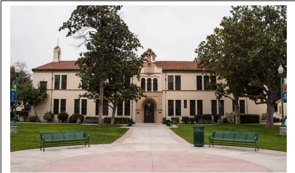
300 Building, east elevation