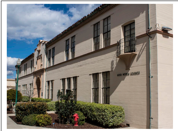
600 Building, west elevation