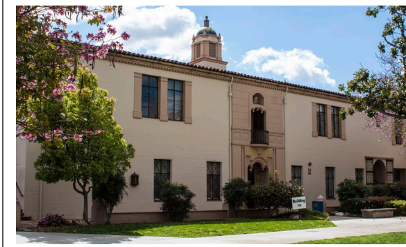
100 Building, partial north elevation

The four original buildings of the campus as well as the central Quad were placed on the National Register of Historic Places in 2023, as the Fullerton College Historic District.