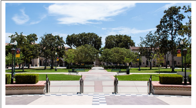
Quad, looking south from Library Building